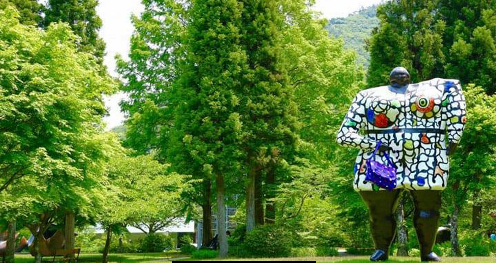
Hakone Open Air Museum