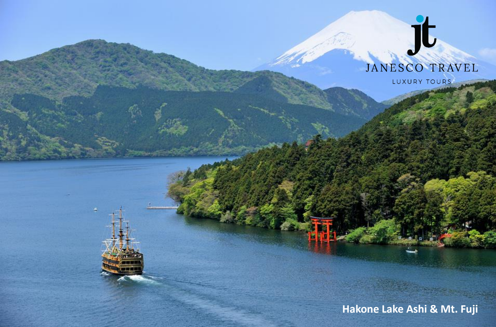
Hakone Lake Ashi & Mt. Fuji