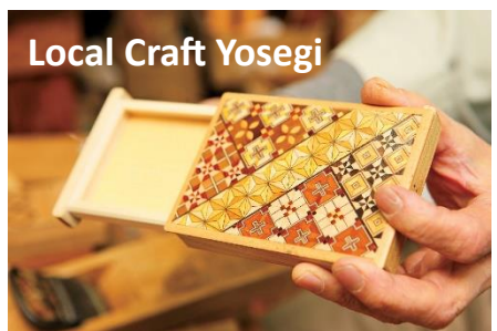
Local Craft Yosegi