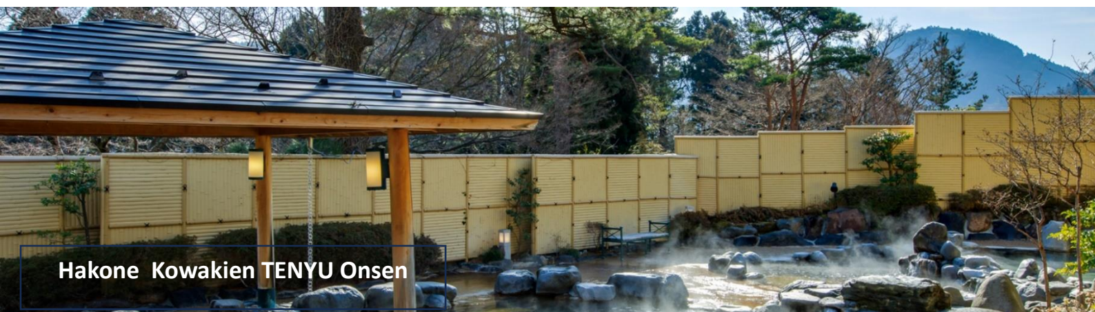
Hakone Kowakien TENYU Onsen

TOKYO: Keio Plaza Hotel https://www.keioplaza.com/