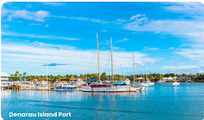
Denarau Island Port