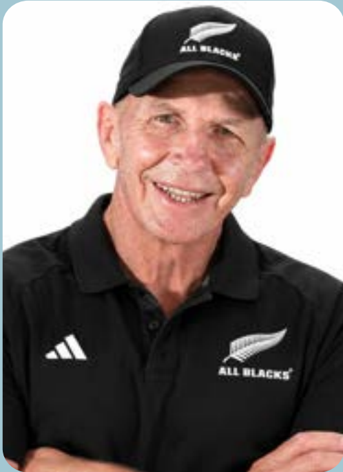
Sir Gordon Tietjens